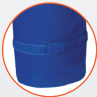
Adjustable wrists and ankles