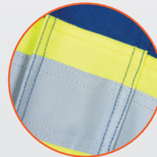
Tough double-stitched seams