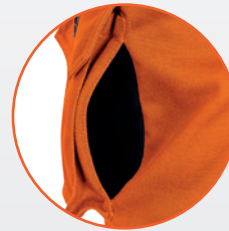
Fleece hand warmers