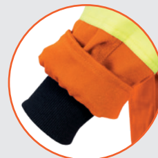
aramid storm cuffs