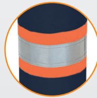
2" double-sewn premium StarTech® reflective tape