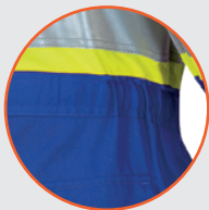
Elastic on the back on either side of waistband